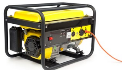
Generator: To back up epileptic power supply