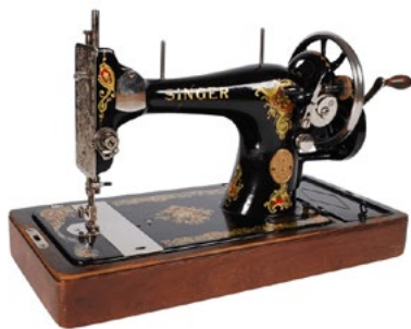
Straight Sewing Machine (Manual or Industrial)

Having adequate equipment for your tailoring business increases your efficiency and eases your production process. Identify the necessary equipment for your production line and focus on buying those that enhance your capacity to professionally respond to your customers. Starting as a tailor, the basic equipment you need are the following: